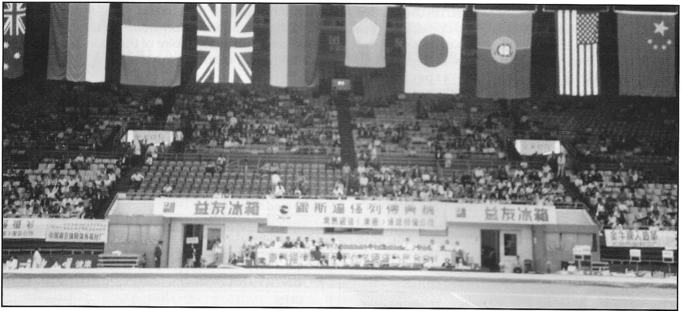
The lovely Capital Gymnasium, largest of its kind in Beijing, was enjoyed by all attending the 2nd World Junior Championships in Sports Acrobatics INSTAR CUP in Beijing.